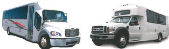
Several lengths of General Motors chassis also available.