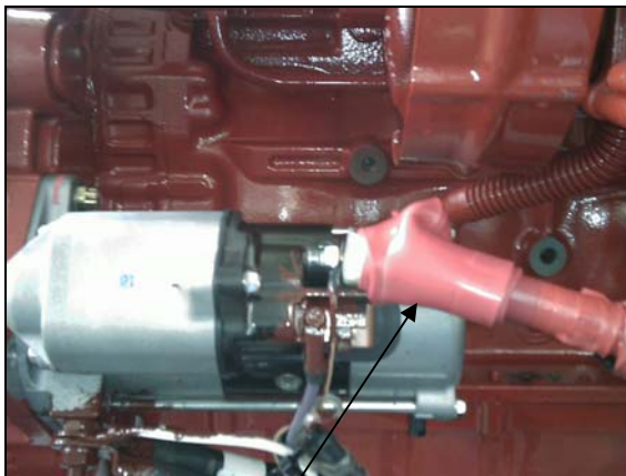
Red Rubber Boot